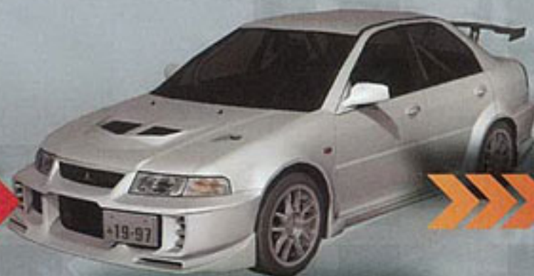
With an aero wing