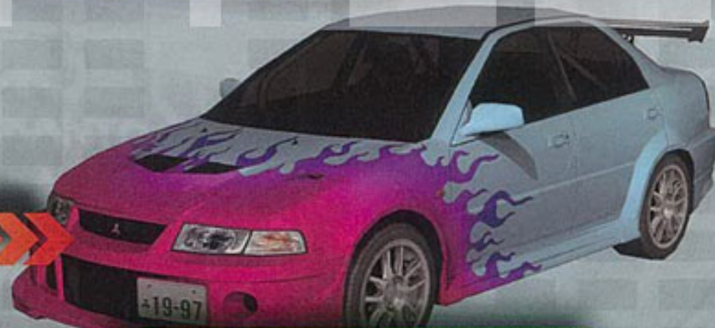
Full-painted & with decals