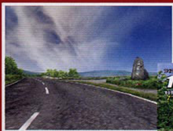
Hakone has been added.

A steep and winding road with tons of undulation!